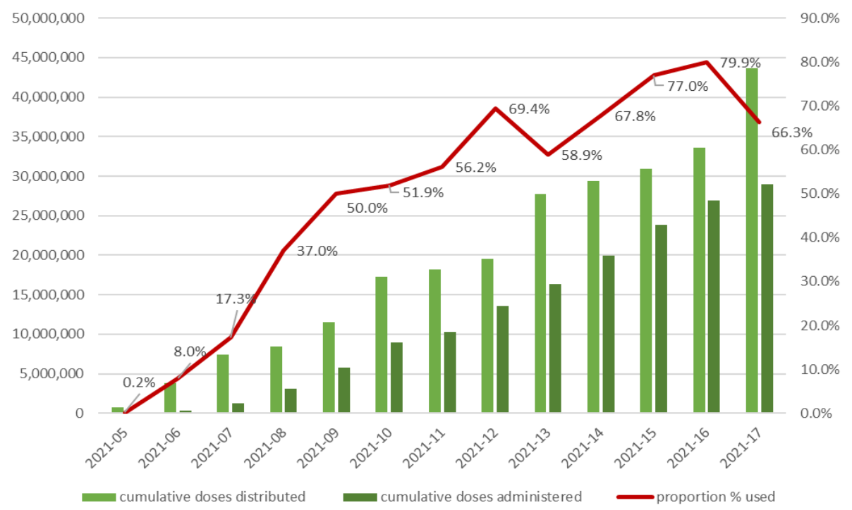
Figure 2. Cumulative doses of Vaxzevria distributed and administered and proportion used in EU/EEA countries per week